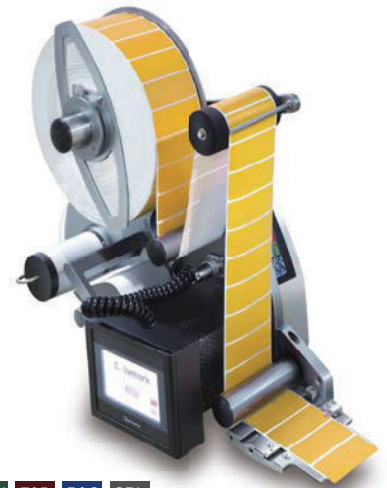
LS100 DAC PHM F&B P&C SRL