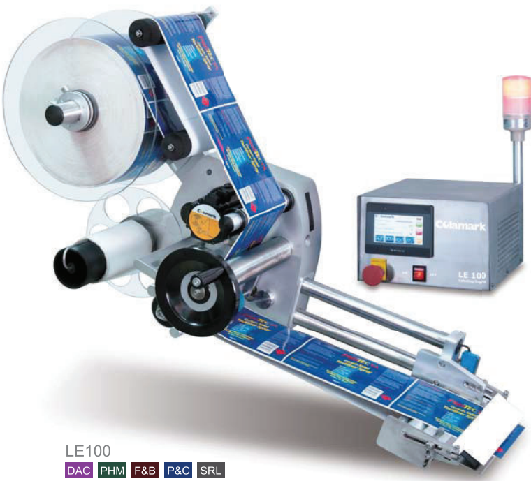
LE100 DAC PHM F&B P&C SRL